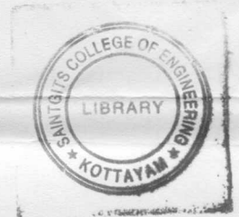
Figure No . 1